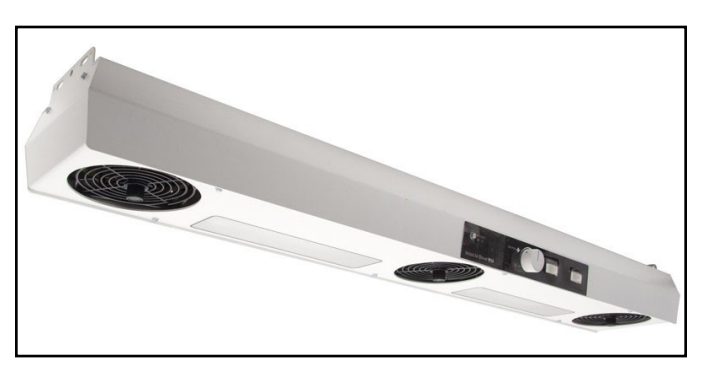
Figure 1. SCS 991A Overhead Air Ionizer