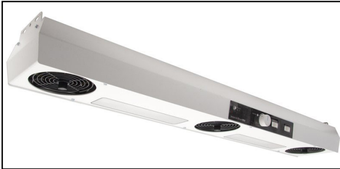
Figure 1. SCS 991A Overhead Air Ionizer