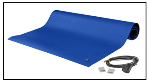
8900 Table Mat Kit shown with included hardware

See the Desco Industries RoHS, REACH, and Conflict Minerals Statement: